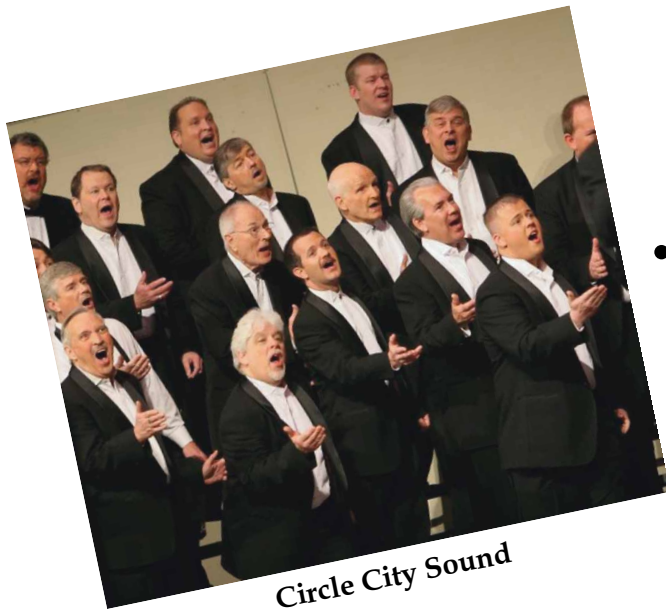
Circle City Sound

Fund-raiser to assist the Circle City Sound attend and compete in the 2010 International Barbershop Competition in Philadelphia, PA